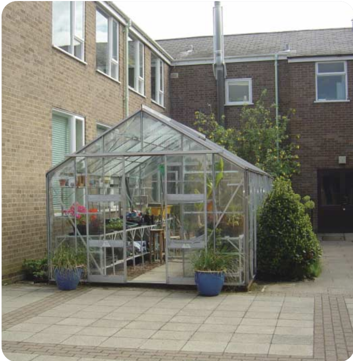
The Organic Horticulture Project

A full report on the projects supported during the current academic year will be produced in September. Meanwhile the new format for the Annual Fund has already proved a great success with the teaching staff, who have become very engaged in what donors to the Fund are making possible.