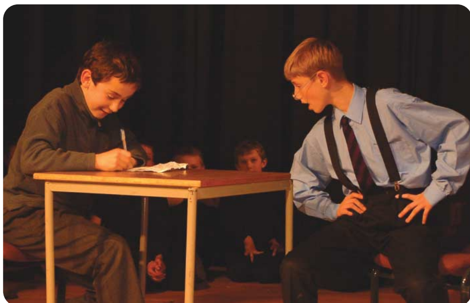
First Form drama evening