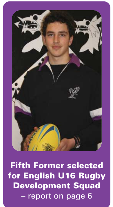
Fifth Former selected for English U16 Rugby Development Squad – report on page 6