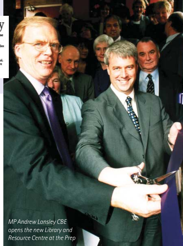
MP Andrew Lansley CBE opens the new Library and Resource Centre at the Prep

The School's Library Policy encourages the love of books and reading: the provision of a new library at the Prep has enabled this to become an established part of school life.