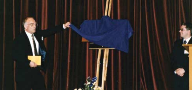
Dr John Rutter opens the New Music School